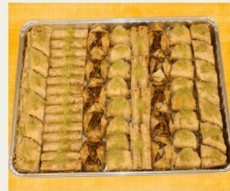
Assorted Baklava Walnut, Pistachio Full Tray - 60 pieces $50