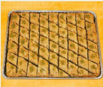
Traditional Baklava Walnut Full Tray - 54 pieces $45*

Through the Syrian Sweets Exchange bake sales around the valley in the past few months, a few talented bakers have taken serious interest in establishing their home business. The bakers are refugees from Syria who have been recently resettled in Phoenix. Give our bakers a chance to introduce their business to the community by ordering baklavas from us for your parties, meetings and events. 100% of the proceeds go to families of the bakers.