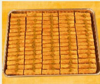
Finger Baklava Walnut Full Tray - 75 pieces $45*