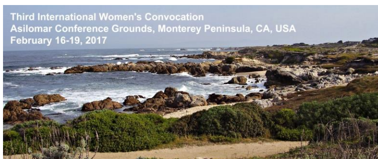
Third International Women's Convocation Asilomar Conference Grounds, Monterey Peninsula, CA, USA February 16-19, 2017

Take advantage of Presidents' Day weekend to engage with U*U women from around the world at the Third International Women's Convocation, Asilomar Conference Center, CA, February 16-19, 2017 . Connect, share, grow, celebrate, and empower in the unspoiled surroundings of this tranquil retreat. Registration is $350. Bring one, two (or ten!) friends from your church and you qualify for a group discount of $50 off each! An additional $50 discount is available for UU ministers. Young adults aged 18-40 can register at a special all-inclusive package rate. If you are interested in offering a workshop, please fill out our workshop request form online. Visit IntlWomensConvo.org for all details.