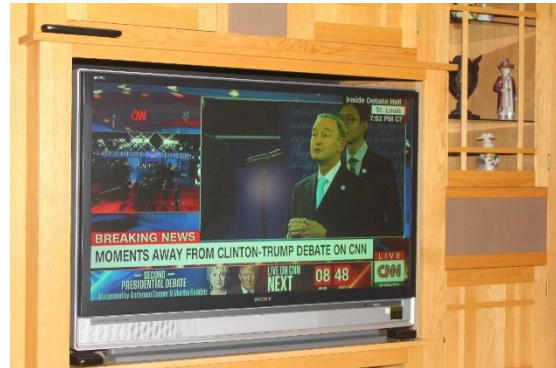
Debate Party FUUND!!!!!!

FUUND Together is VUU's largest annual fundraiser. The auction gives each of us the chance to support VUU's mission and programs by donating an event and/or purchasing ticket(s) to FUUND event(s).